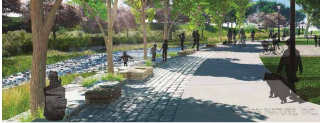
The proposed Lick Run corridor with the urban waterway, mixed-use trails, native vegetation, and open spaces. Renderings by Human Nature

Such indirect benefits can be doubly advantageous for municipal sewer districts because the net effect of urban redevelopment is an expanded customer base. And compared to suburban sprawl – which requires new infrastructure but tends to have relatively low customer density – urban renewal enables sewer utilities to create greater revenue from areas where infrastructure is already in place.