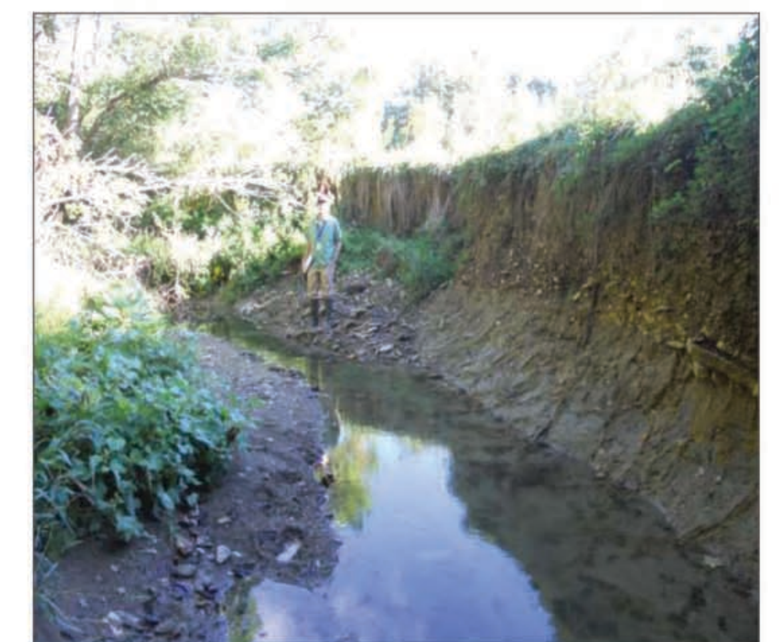
Erosion of Kings Run stream