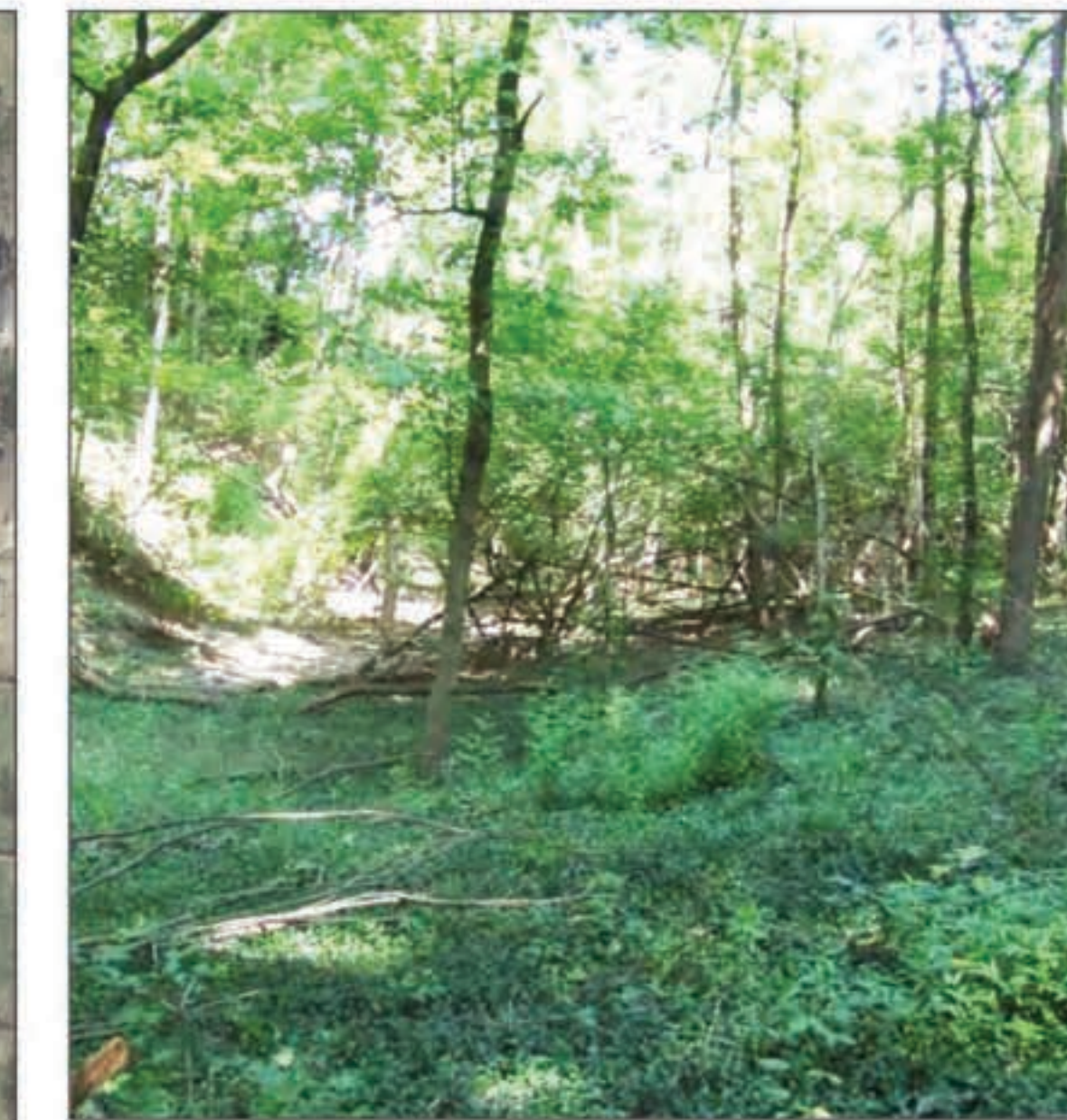
Photo of Basins 1 & 2 area